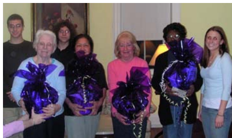
The Game Night Gift Basket Winners.

group to make the night a success. The game of choice by the ladies of the Mt. Kemble home was Bingo. The students called out the numbers while the League members helped to check cards. Many gift baskets and gift certificates were won and everyone received a goody bag for participating. The evening concluded with coffee and delicious desserts.