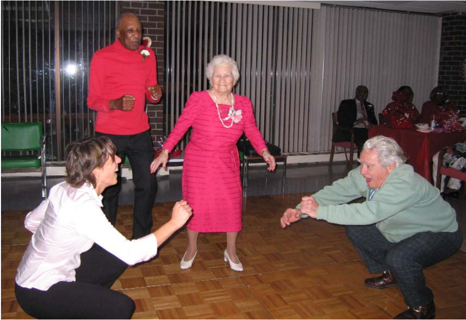
JLM members and Seniors enjoy themselves at the Senior Prom