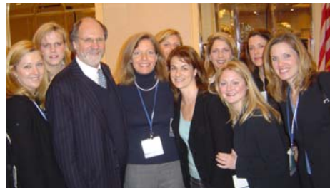
SPAC Delegates with Governor Corzine.

In January, eleven State Public Affairs Committee (SPAC) delegates traveled to our nation's capital as participants in the 69th annual "Walk to Washington" organized by the New Jersey Chamber of Commerce. The Chamber's tradition began in 1937 when several of the state's top business executives took a train to Washington, D.C. to have dinner with New Jersey's congressional delegation. Today some 2,000 of the state's top political and business leaders participate in this event that provides an invaluable networking opportunity for (SPAC) of the New Jersey Junior Leagues.